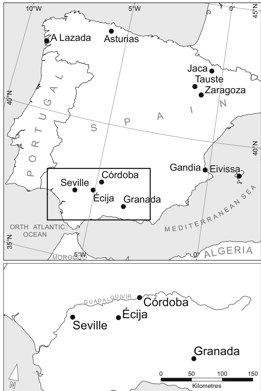
Fig. 1 Map locating Écija in comparison to Seville, Granada and Córdoba