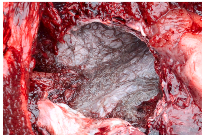
Fig. 1. Nematodes found in the pterygoid sinuses during the necropsy of a short-finned pilot whale ( Globicephala macrorhynchus ).

counted, measured, and classified by stage and sex using an Olympus SZX7 binocular stereomicroscope at 30x. Those that were preliminary identified as Stenurus spp. were classified as mature or immature according to the sclerotization of the spicules (males) and gravidity (females).